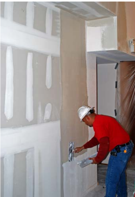
Final packing of the sheetrock

Many, many, more great photos of our construction project are posted on our website at www.dhlc.org/construction .