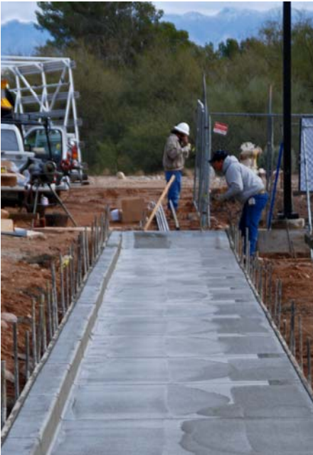
Pouring the new south entry sidewalk